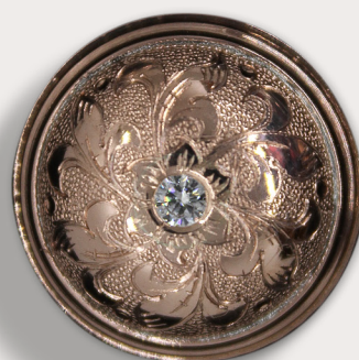
14K GOLD CROWN WITH DIAMOND