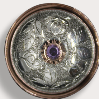
SILVER CROWN WITH AMETHYST