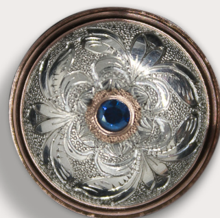
SILVER CROWN WITH SAPPHIRE

Crowns come in standard or lightweight. All gems are set in 14K gold.